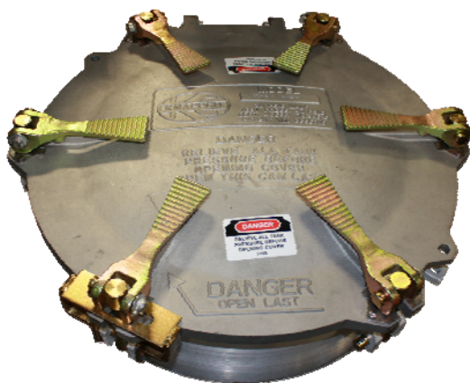
LM1110 20" Full Opening Pressure Manhole (Shown)

OBSOLETE - NO LONGER AVAILABLE CAM AND HANDLE HARDWARE STILL AVAILABLE